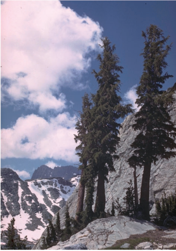
Fig. 2. ACC has driven an increase in precipitation in much of the more northerly latitudes (IPCC, 2014). This has, in turn, driven complex responses in wild plants. Mountain hemlock ( Tsuga mertensiana ) has shifted the centre of gravity of its distribution to lower elevations in California (a 255-m downwards elevational shift), in spite of an increase in mean annual temperature of 2.85 °C during the study period (1930s to 2000s). The observed downhill shift, while counter to expectations from warming, was in concert with a decline in water deficit of 134 mm over the past 70 years (Crimmins et al. , 2011).

these changes in distribution mirror changes in water availability, and so species were actually tracking geographic shifts in their climate niche over time, but that niche was driven mainly by water deficit rather than temperature (Fig. 2).